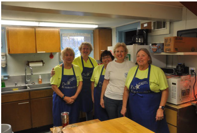
The Kitchenettes ready to feed everyone!

The weather was perfect. Warm, clear skies, no rain.... but LOTS of mud!!! A little dirt never hurt anyone, right???