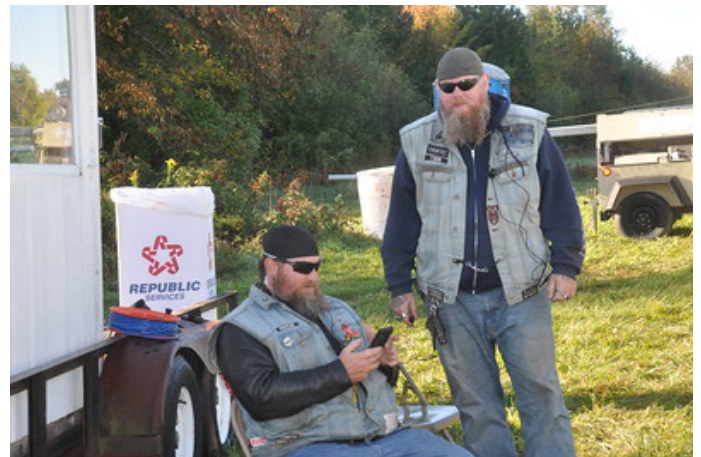
Hustler and Thor up at the trailer making sure everything goes smoothly