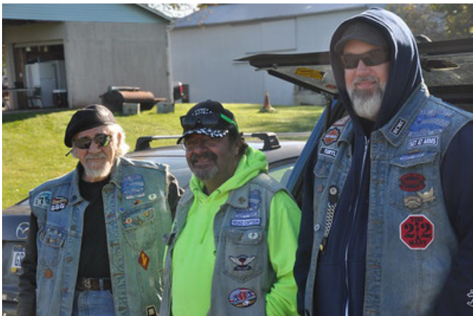
Sonny, Sparky and Turtle overseeing things...