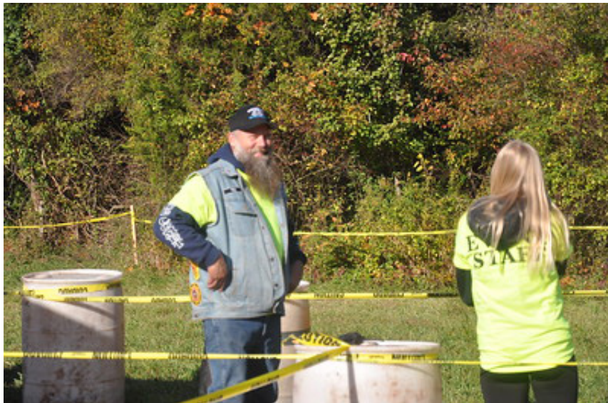
Tex and Queenie waiting for the race to start!