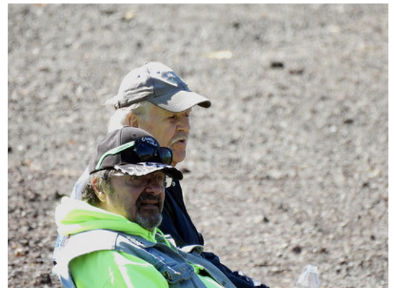
Sparky and R.O.N. waiting...