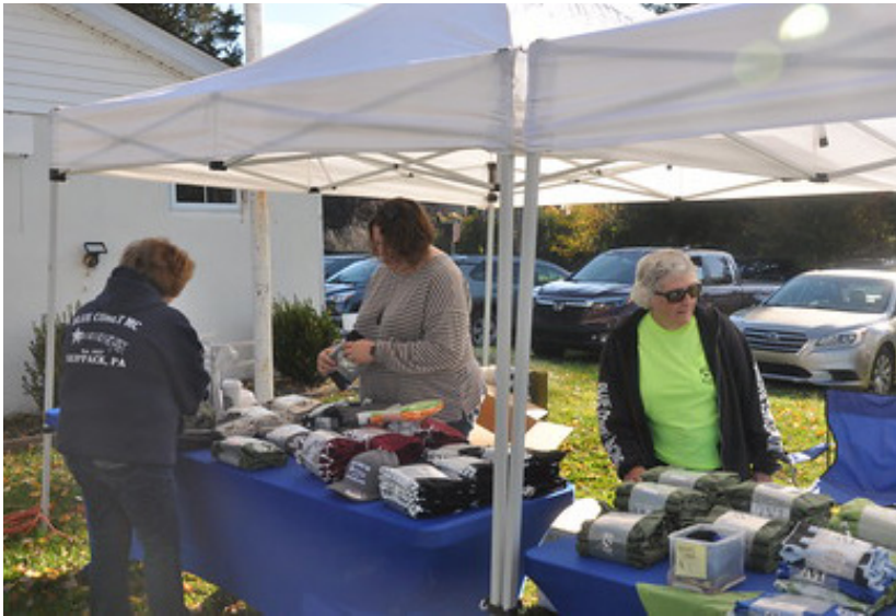
Products tent...anyone for a tee shirt?