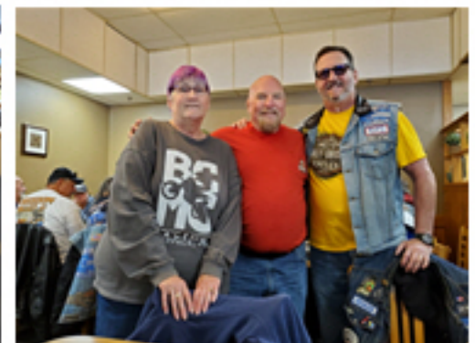
Purple, Heinzie, Wrench