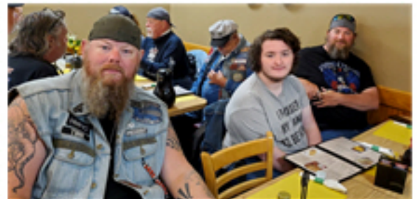
Thor, Seth, Hustler

20 got together for a delicious Father's Day breakfast before heading out to other family activities.