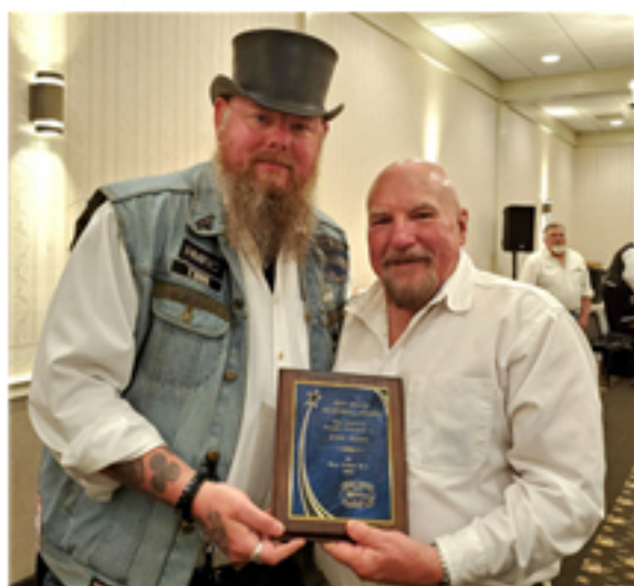
John- Oop Allen Memorial Award

The winner of the Billy Nice Memorial Award will appear in the next issue.