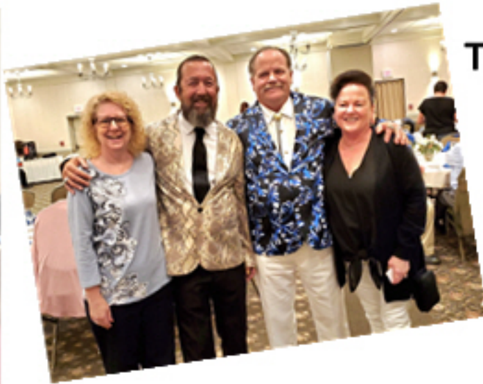
The fancy jacket club