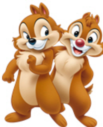
Chip & Dale