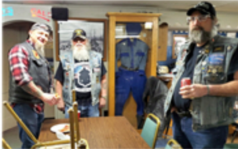
We had a visit from the President of The Leathernecks