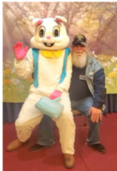
Even the Easter Bunny gets to sit on Santa's lap!