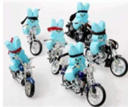
Peeps 1% ers