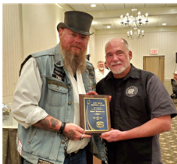
Brent- Bart Sklar Memorial Award