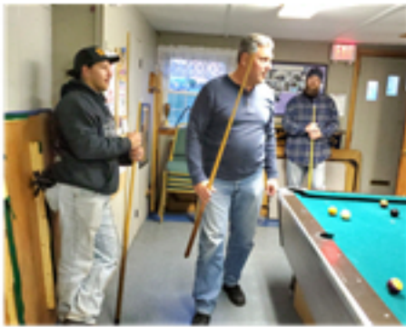
Play some pool