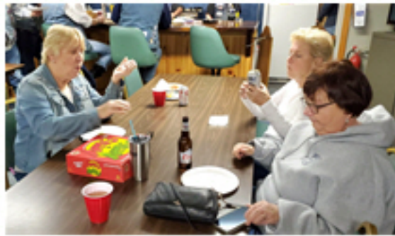
Play some cards