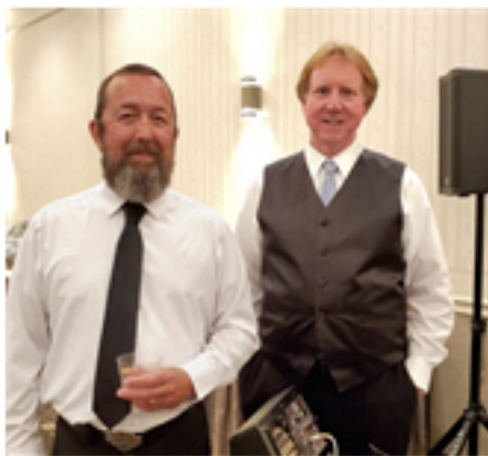
Chip & Dale