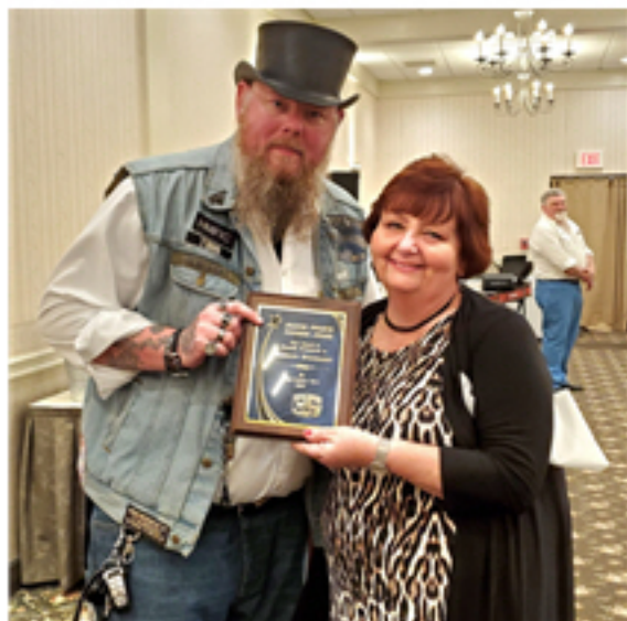
Marilyn- Jeanne Swartz Pioneer Award