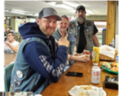
Hang out at the bar