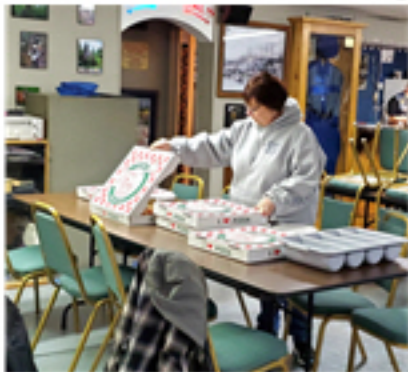
Eat some pizza