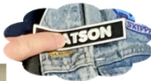
Or at least his ATSON