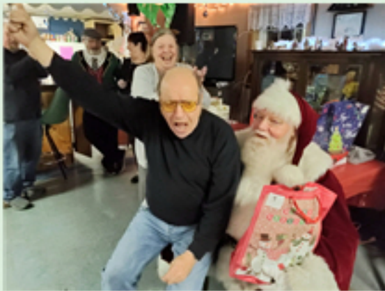
Power to the People!