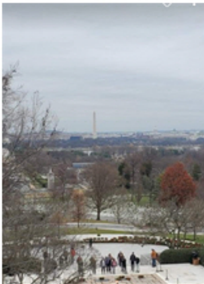
View of the Washington Monument from Arlington