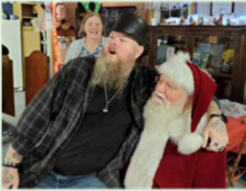
Tiny Tim & Santa