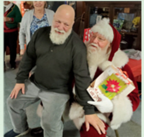
A squeeze of Santa's knee, extra gifts won't guarantee!