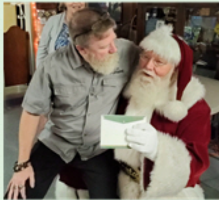
Now, Santa, about that Dukati I asked for...