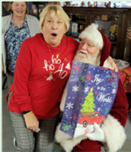
Sing for your supper!