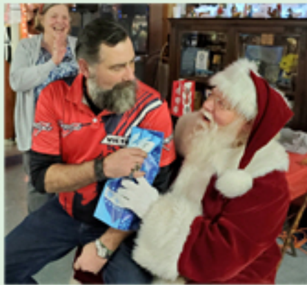
Have you been a good little boy?