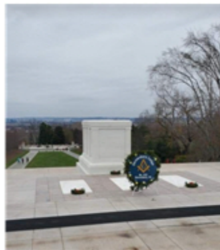
Tomb of the Unknown Soldier