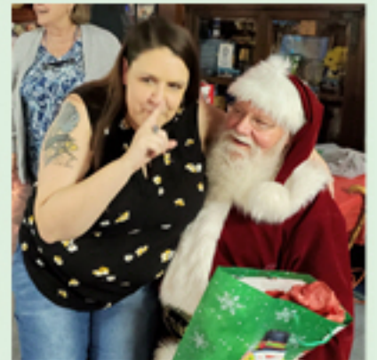
Don't you tell a single soul what I'm going to say!