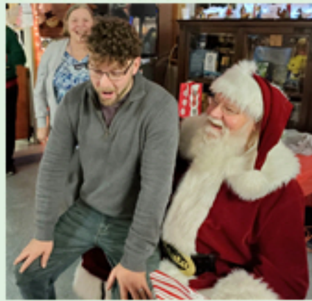
I didn't sign up for this when I joined BCMC!