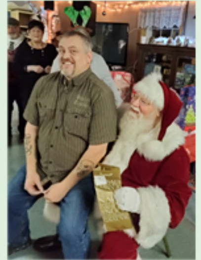
I've been a bad boy!