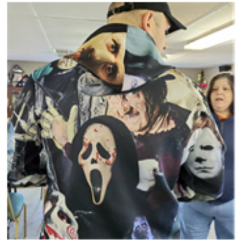
Cool jacket of villians