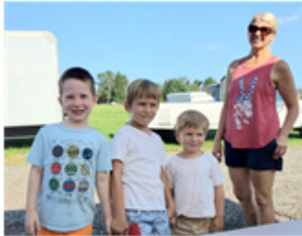
We had a bunch of little kids riding the field & some more serious riders on the track.

On 9/19/21, several BCMC members attempted to support BACA Bucks' 3rd Annual Bike Show.