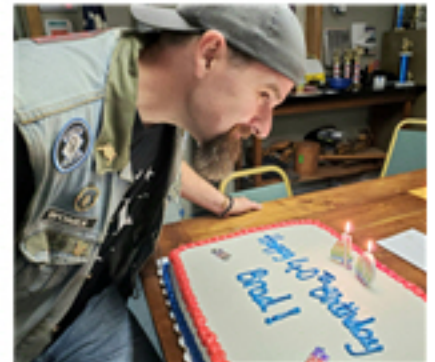
Make a wish!