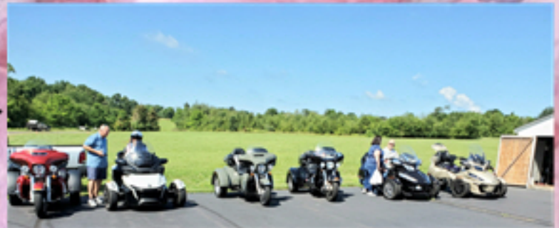
The trikes were near.