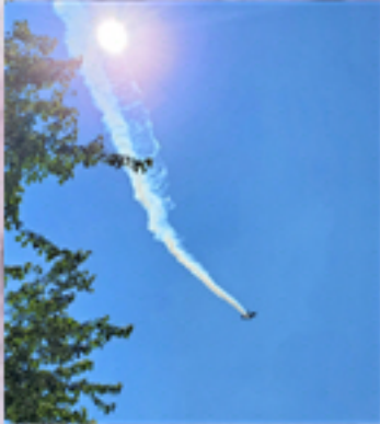
The skies were clear.

We had a picture perfect day and fantastic participation for the huge Skippack Parade!