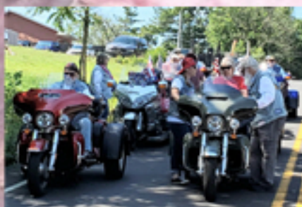
All biked up with nowhere to go.