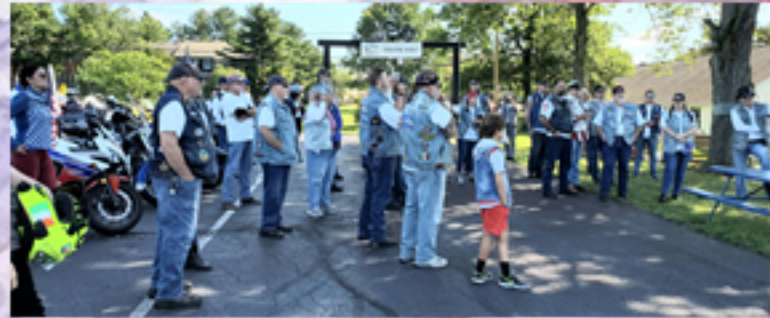
The club was here.