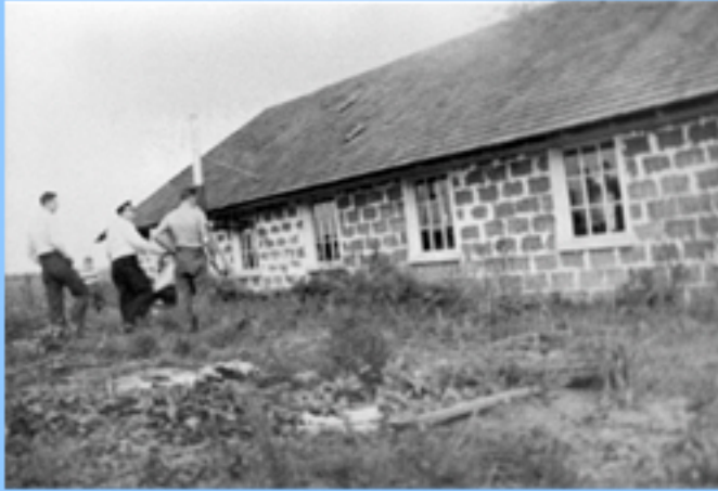
'Well, she ain't pretty, but she's ours'