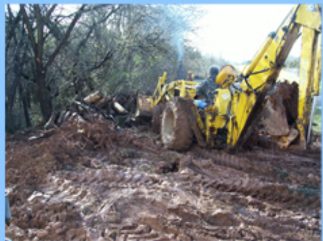
Ground prep to add trailers just past the tractor barn