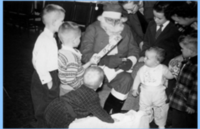
Who was this Santa Claus?