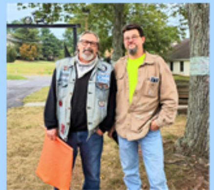
Mole & Grinder