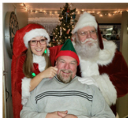
Life at the North Pole

And what Christmas Party would be complete without a lap dance with St. Nick?