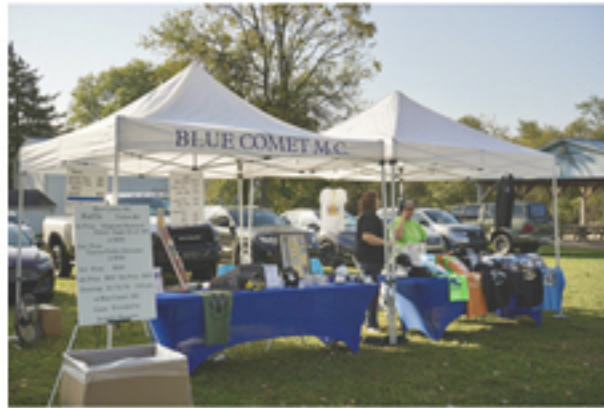
Products had a great day!