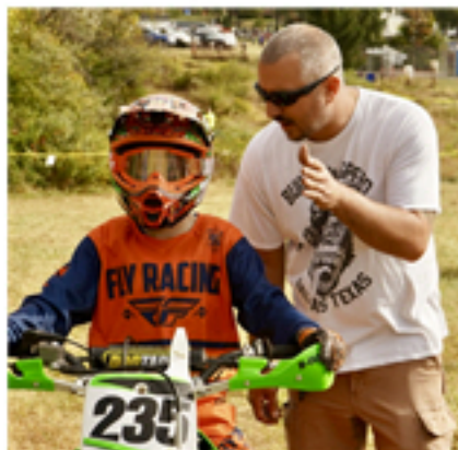
Some last minute advice