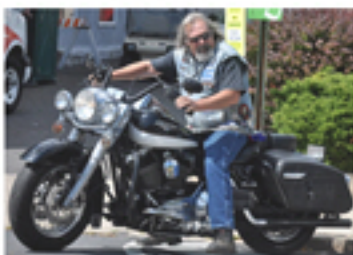
The Mole rides in