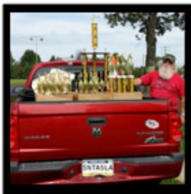
Santa brings the trophies

On 9/6/19, Motorcyclists for Jesus shared an evening with BCMC for the 9-11 Memorial Service to honor our Veterans, First Responders & Hometown Patriots.