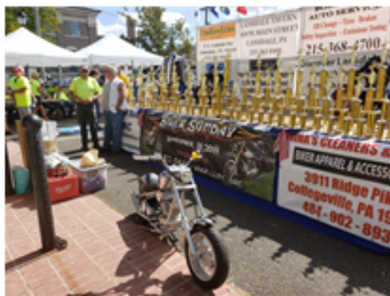
The trophy stage is set