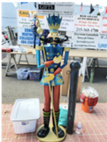
The King Daddy of Bike Nights