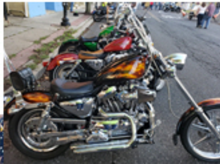
Sonny & Rock