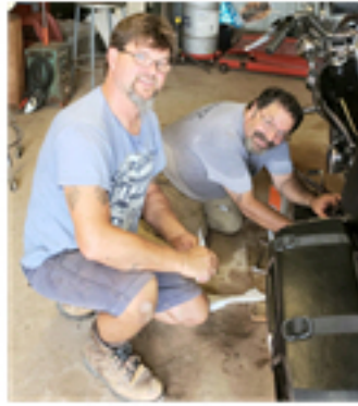
Grinder & Sparky tinker