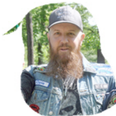
Our thanks go out to Opie, who stepped up to fill the recently vacated Sgt. at Arms position.

On 6/8 we sent a detail of hardworking members to Morgantown Bike Night to help Mike Lightcap.