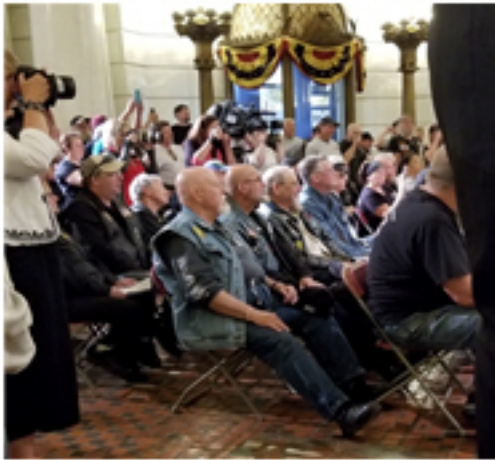
The Capitol in Harrisburg.