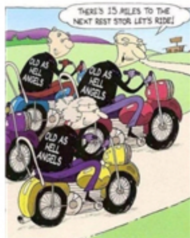
SENIOR BIKE GANGS