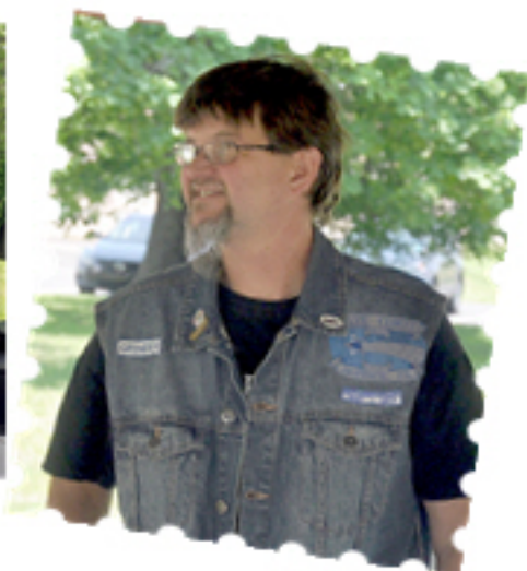
Our winners with Sparky