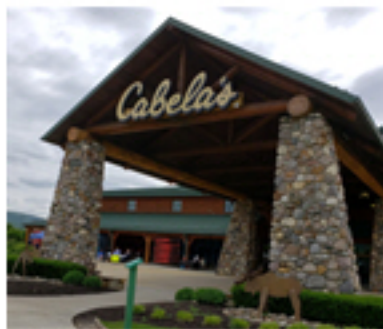
Registration at Cabela's