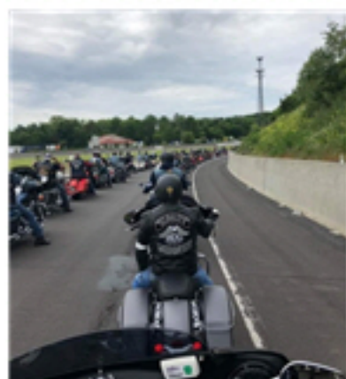
A beautiful day for the ride to Fort Indian Town Gap