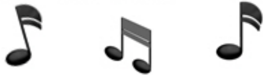
Name That Tune