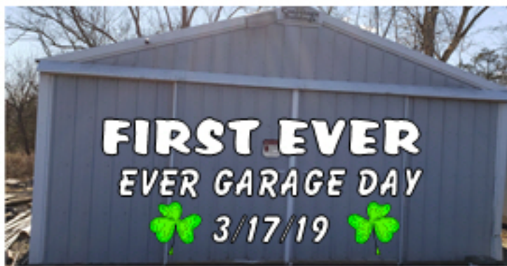
Greg's dream come true...